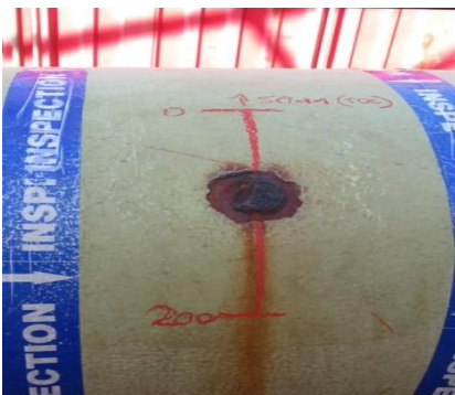
Figure 1 Photograph of visually identified external blister